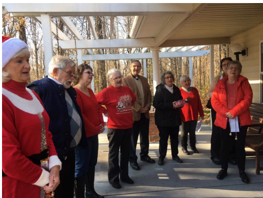
Caroling to our shut-ins